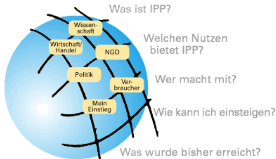
Bayerisches Netzwerk der Akteure