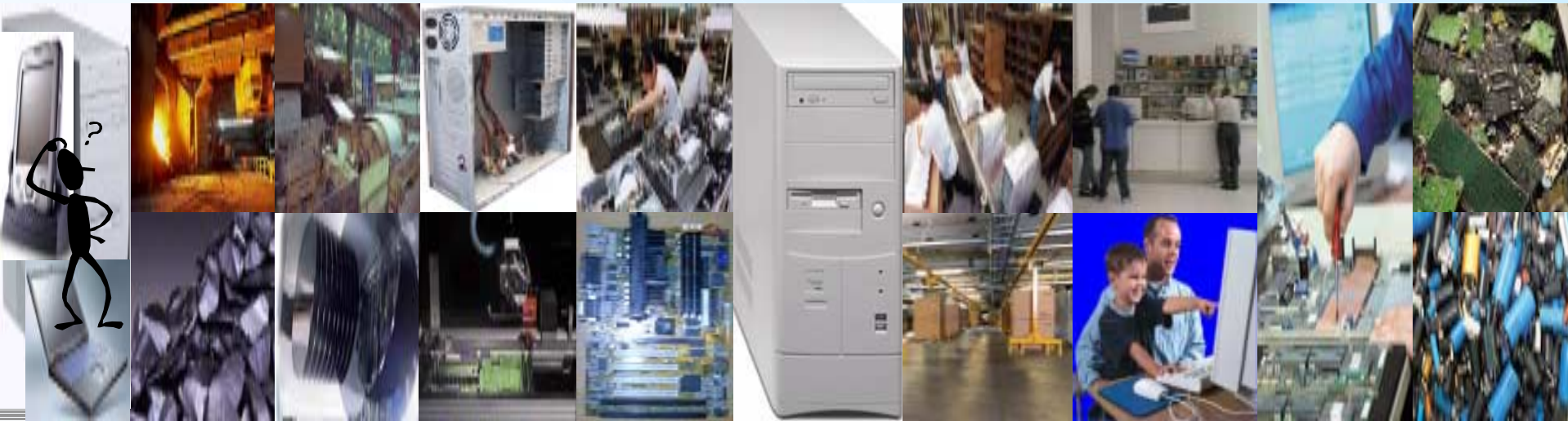
Raw material extraction